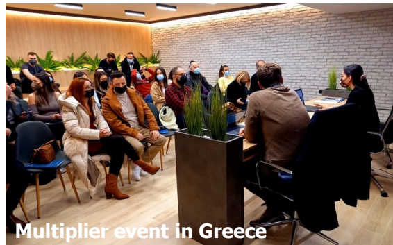
Multiplier event in Greece

❖ "Our mission is to create an international network of intercultural mediators that support young people and young people with migrant backgrounds in their inclusion, active participation, and integration. We heartily invite everyone to join us in our efforts to create a more open and resilient society."