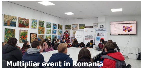
Multiplier event in Romania